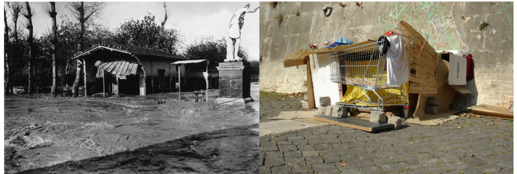
Andrew Hazewinkel Domus Sub/Merge 2006-09 detail Pair #5 of 8 pairs (16 individual) giclée prints on archival paper. Individual prints 28.8 x 42cm. Paired prints 28.8 x 84cm. Installation dimensions variable.

The seeming contemporaneity of the subject may have attracted Hazewinkel to this small drawing. For many years, and many European sojourns, he has captured footage of rivers in flood, gathered archival photographs of familiar locations made unfamiliar by the deluge, and documented the accidental installations and every-day accidents that appear as the water recedes. Whilst the specific locations are less important than the flotsam and jetsam that eddies and swirls or the patterning and marking that appear in the mud, I cannot help be fascinated by familiar locations made unfamiliar by extraordinary events. Rome's Pantheon half-submerged in the Tiber's excess; or furniture floating by as rivers burst their banks – the domestic made unfamiliar through its watery change. There is a stillness to these photographs, and silence from the absence of people and human form, which is belied by the raging fury of the video footage however much it is slowed down. Nature unleashed has the ability to make even the most ubiquitous item of 21st living, the plastic bag, an object of beauty and – albeit ambiguous – wonder.