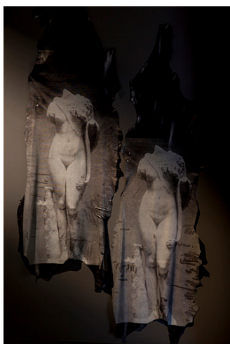
Suspicious Marble 2014 detail All In Time installation detail

from this site is not the usual recording of history, nor Goya's sense of monstrosity, but something more ambiguous and restless. Desire is at play here. The female torsos appear revived, as though seeking to eradicate centuries of age with a new expressive life, the marble replaced by skin, stillness replaced by yearning. Yet the history of this figure is complex, for it's not a classical statue but a nineteenth century forgery. The figure's desire to come alive is mixed with its claims to Antiquity; its material presence commingles with its inauthentic reality. The subtle pliability of material and image, past and what is present ultimately haunt the rigid column - it's tempting to consider it more like a phallus of human height - that emerges out of the desk before it. The authority of written history is shadowed by a more complex, if still softly monumental, set of negotiations.